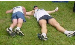
Post-race party animals!